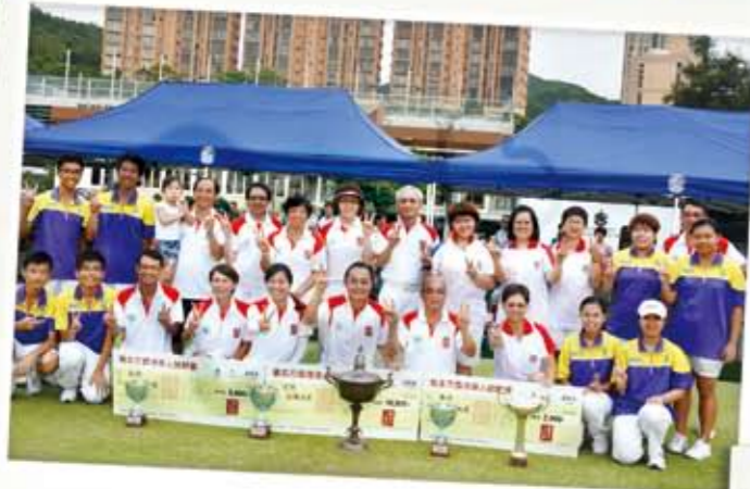
Nong's representatives and Summer Finals Day participants