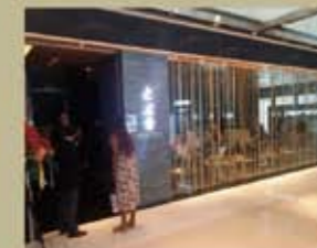
中環國際金融中心 商場 303 號舖