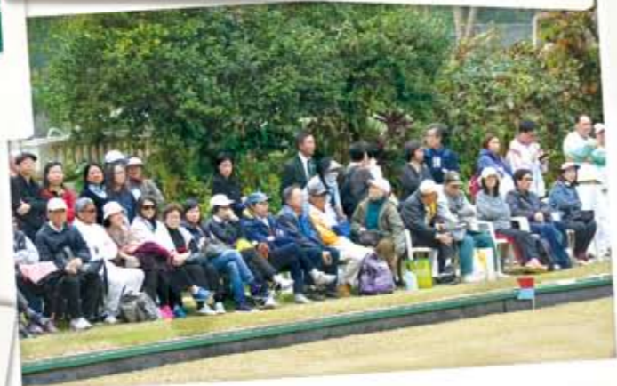
Winter Finals Day crowd at KBGC