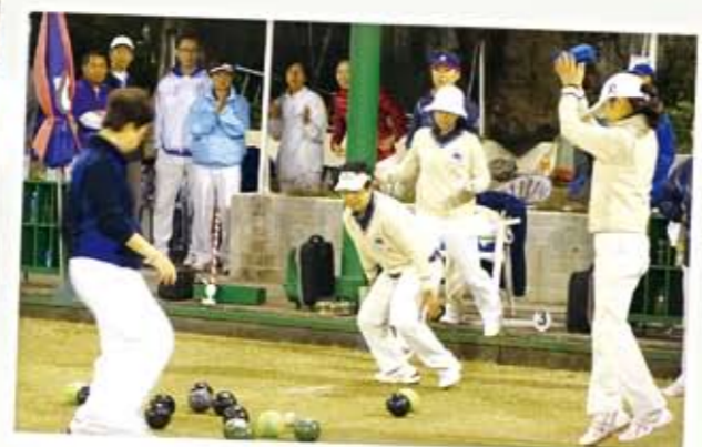
What a conversion shot!