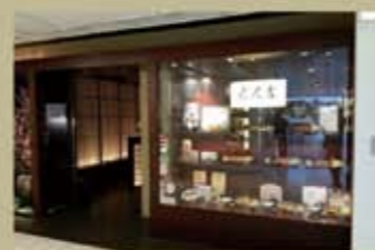
銅鑼灣世貿中心 4樓 412 號舖

「香港味之年賞」，全港有 116 家入圍餐廳，只有 7 家獲最高榮譽 AAA 級。而當吉在此 7 家之中居首位！當吉「專注正宗、上乘吉列」！吉列豬扒當然是主角，選用的日本黑豚，含油份較多，故特別肉嫩多汁。吃時蘸上混合芝麻的秘製醬汁，更覺惹味，水準猶勝日本當地的吉列專門店。除吉列豬扒外，店內亦有其他吉列食品及上級刺身供應。當中最受歡迎的包括有 12 吋長的吉列車海老、吉列帶子及吉列生蠔等。