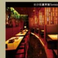
尖沙咀廣東道 100 號 10 樓