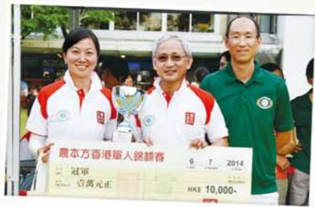
Nong's Women National Singles prize presentation