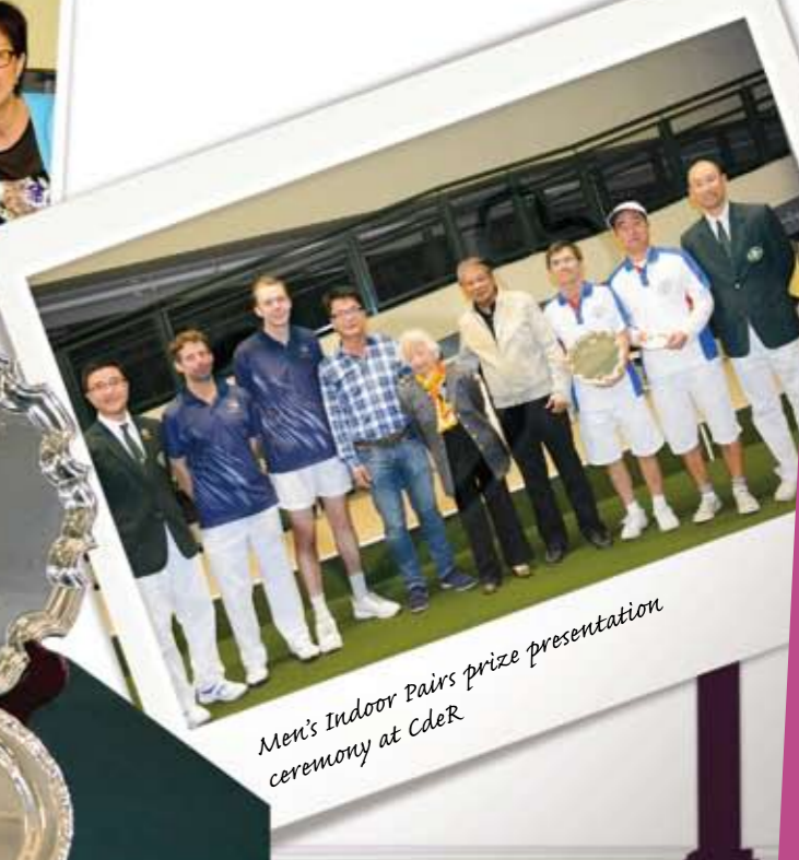
Men's Indoor Pairs prize presentation ceremony at CdeR