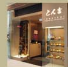
尖沙咀 The One 4樓 401 號舖