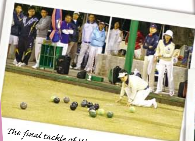
The final tackle of Women's National Triples