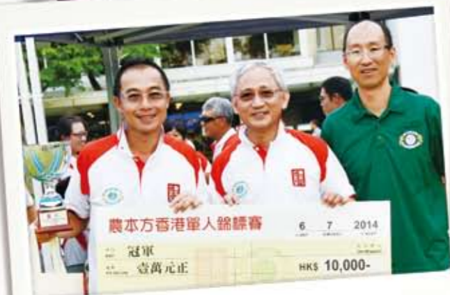
Nong's Men National Singles prize presentation