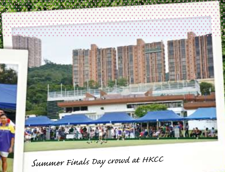
Summer Finals Day crowd at HKCC